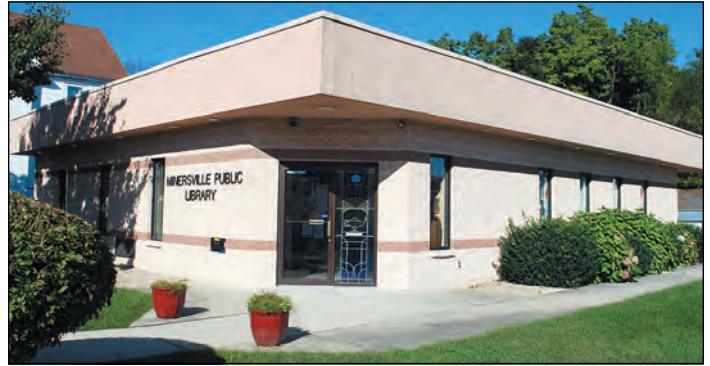
SEE WHAT'S HAPPENING - 220 S. FOURTH ST.

Funding support by the public and our patrons is needed in order to continue to offer free participation programs for children and adults. Upcoming activities include our 2nd annual Junior Rock Hound Day (ages