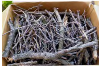
Tree Branches (no longer than 5 ft in length and no larger than 6 inches in diameter)