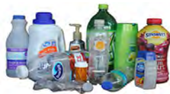
Plastic containers # 1 -7