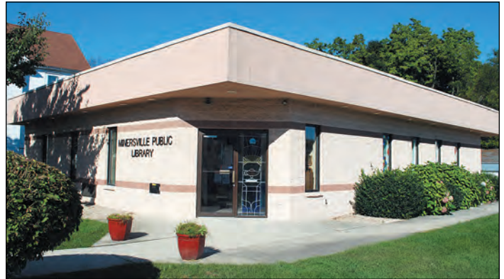
SEE WHAT'S HAPPENING - 220 S. FOURTH ST.

The annual Shop & Drop Christmas Basket Auction is always popular and will return this year. The Super Bowl Party Pack, including a big screen TV and gift