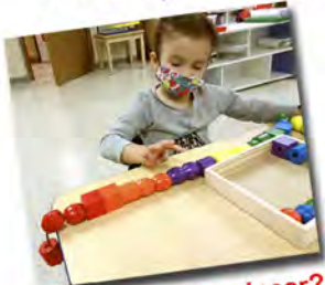
Maybe an Engineer?

Did you know that 90% of a child's brain is developed BEFORE they enter kindergarten?