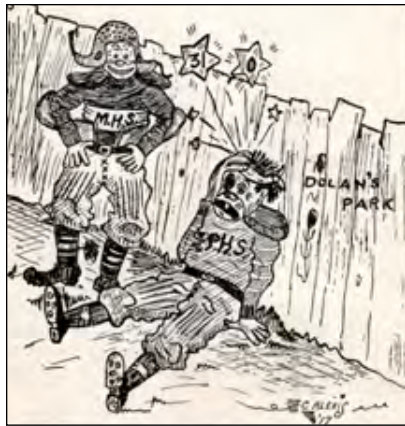
"THE COMEBACK" Yearbook comic commemorated the win over Pottsville.