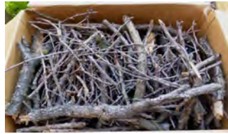
Tree Branches (no longer than 5 ft in length and no larger than 6 inches in diameter)