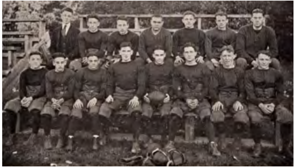
1921 MINERSVILLE HIGH SCHOOL FOOTBALL SQUAD - COUNTY CHAMPS

rained all morning. Symbal's complaint of rain backfired; the field was now in worse shape than it ever was for a game. The field had turned entirely to mud.